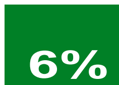
POINT OF SALE